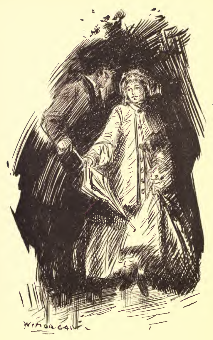
"All right,' she said; 'then I suppose I shall have to take it." [Page 88.]